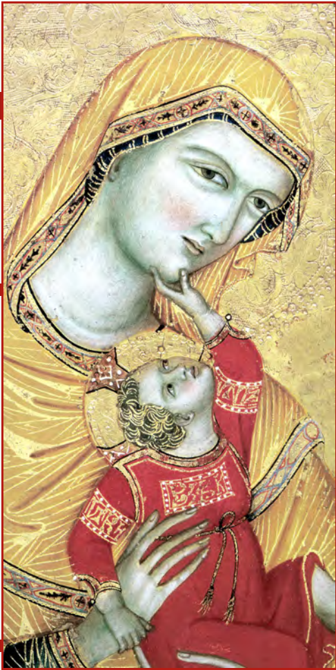
Madonna e Bambino · Maestro della Madonna di Perugia

FRIDAY, FEBRUARY 3 · 7:00-9:00PM ST. ANTHONY OF PADUA · THE WOODLANDS, TX